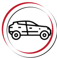
SUV / 4x4 cars