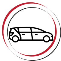
Combi / Station Wagon