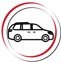
Minivan cars / MPV