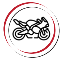
Motorcycles and scooters