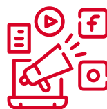
Social media and online publications

Offline (billboards and local newspapers ).