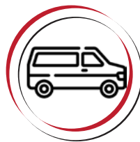
Commercial vehicles / Pick-up